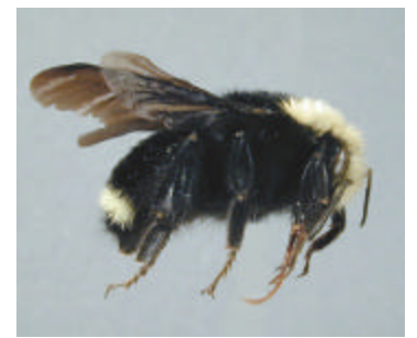
Yellow-faced bumble bee